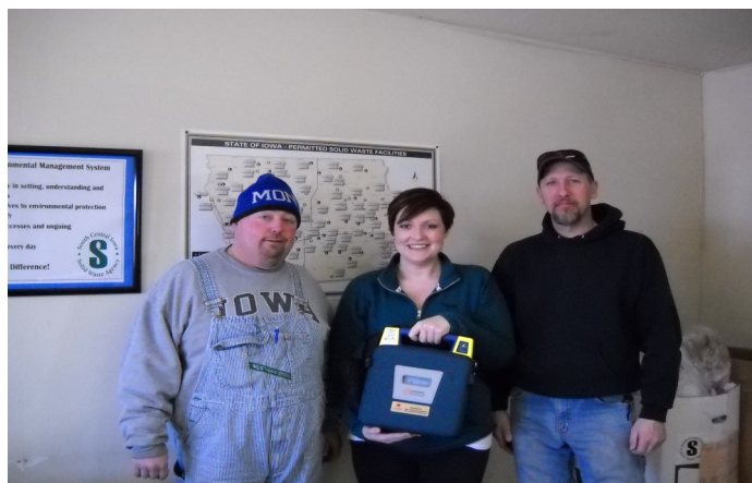
South Central Iowa Solid Waste Agency (Malcolm staff above, Tracy staff below)