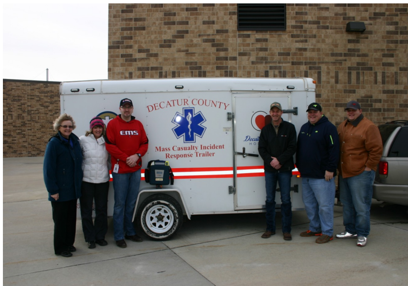
Decatur County Mass Casualty Incident Response Trailer (shown above)

Any Iowa business or community organization with a determined financial need interested in obtaining an AED is encouraged to contact the Iowa Heart Foundation at 515-633-3555 to obtain an application form.