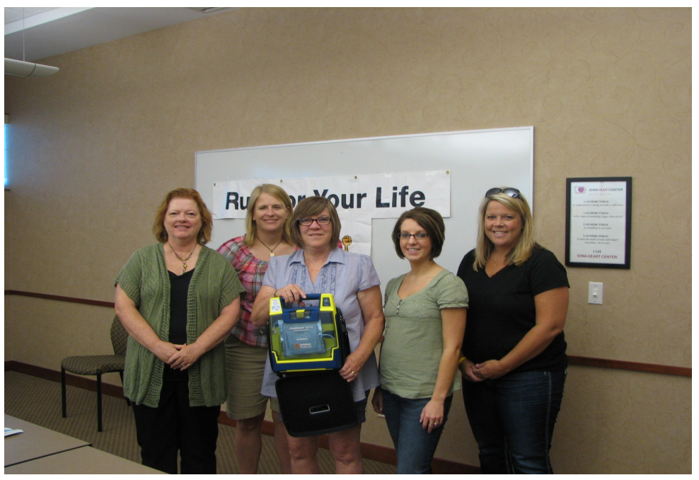
An AED donation was accepted by the staff of Mainstream Living of Des Moines/ Ames on July 9, 2012.